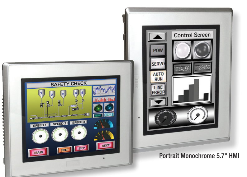
Landscape Color 5.7" HMI